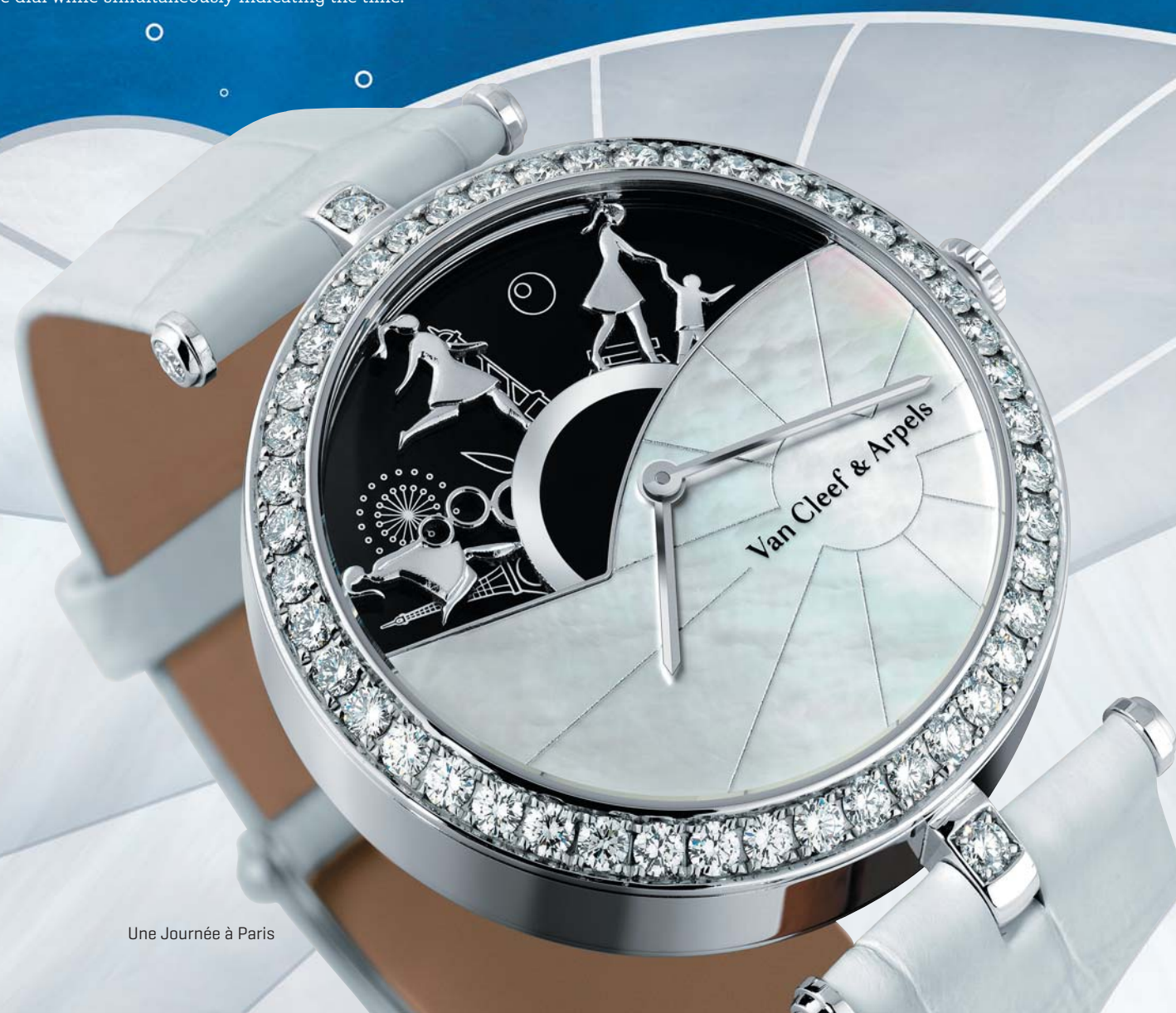
Une Journée à Paris

A perfect example is a watch Van Cleef & Arpels debuted early this year at the Salon International de la Haute Horlogerie (SIHH) trade show in Geneva. It is Le Pont des Amoureux (the Lover's Bridge), named for a famed bridge and favored lovers' meeting place in Paris, where Van Cleef & Arpels has its headquarters. The watch's story is told by two figures playing out a scene on the dial while simultaneously indicating the time.