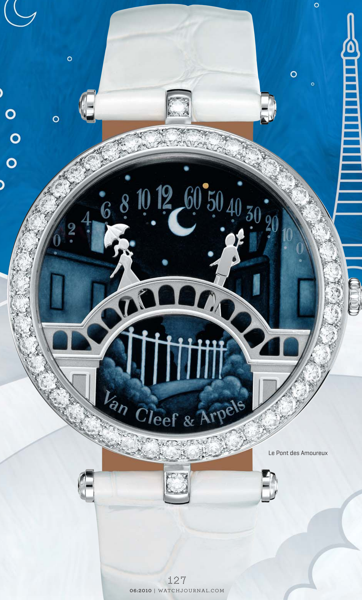
Le Pont des Amoureux