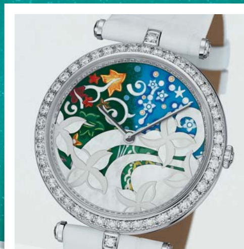
ROMANTIC ENGLISH GARDEN