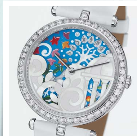
ITALIAN RENAISSANCE GARDEN

THE COLLECTION The Poetic Complications collection comprises a range of mechanisms, motifs and techniques that combine and recombine in the 20 timepieces created to date.