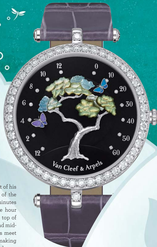
The Butterfly Symphony with retrograde hours and minutes indicated by butterflies flitting around a sculpted gold tree