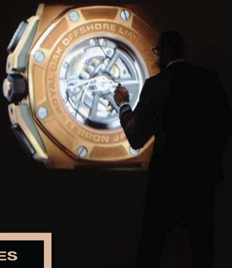
▲ LeBron James signing the crystal of his Audemars Piguet Limited Edition Royal Oak Offshore.