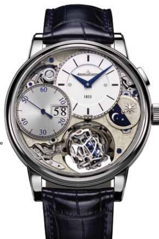
► Jaeger-LeCoultre Master Grande Tradition Gyrotourbillon 3 Jubilee