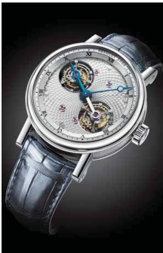
▲ Breguet Classique Double Tourbillon