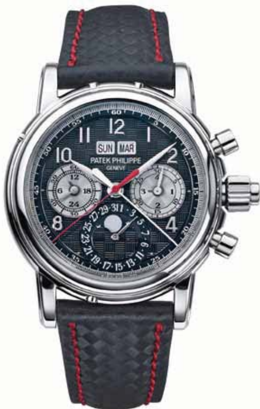
▲ Patek Philippe Only Watch Ref. 5004T Unique Piece