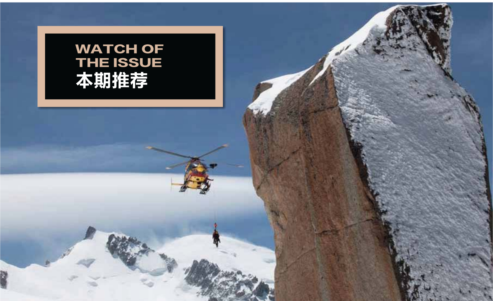
▼ Breitling Emergency II