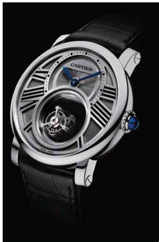
▲ Cartier Double Mystery Tourbillon