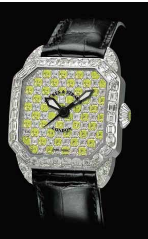
▲ Backes & Strauss Berkeley Imperial