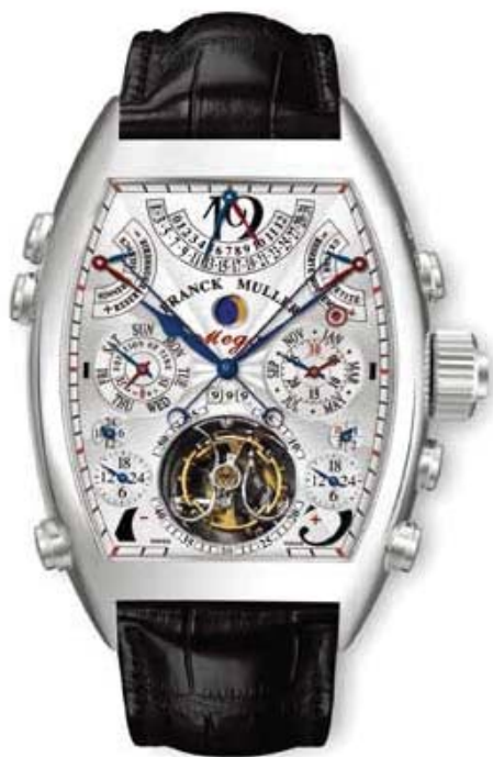
▲ Franck Muller Aeternitas Mega 4