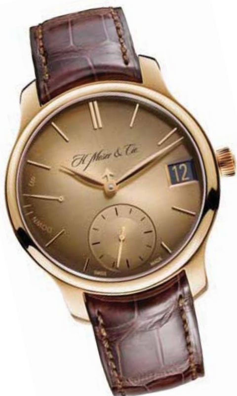
◀ H. Moser Perpetual 1 Golden Edition