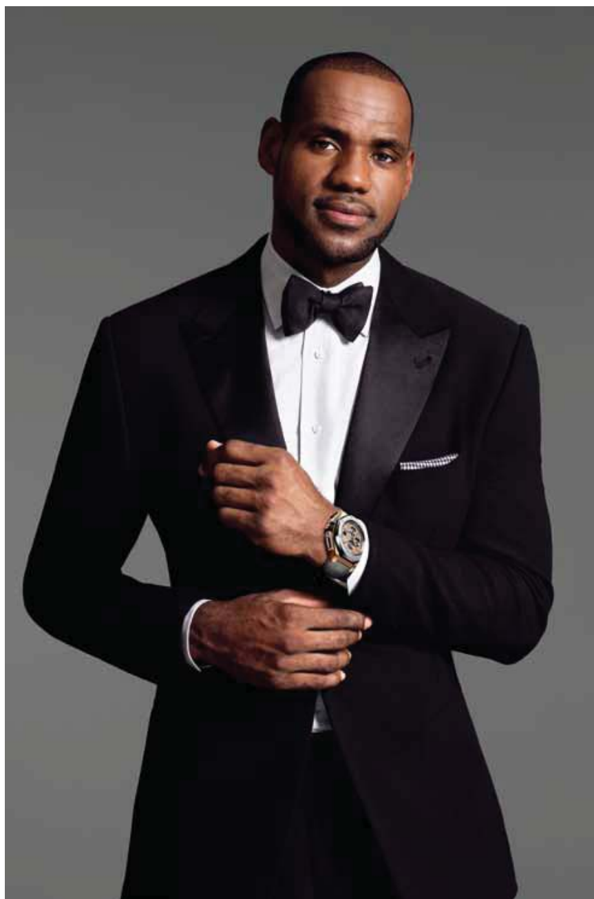
▼ LeBron James, basketball superstar and watch connoisseur.

“我坚信成功需要不断的突破。场内场外，我一直努力地完善自我。成功就是一个进行时：无论你好，下一步永远只能还是进步。”