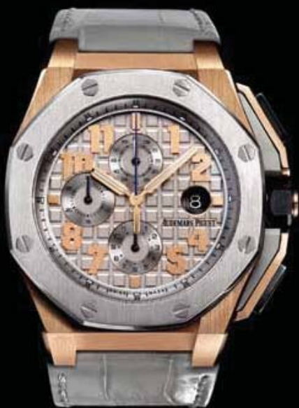
◀ Audemars Piguet Royal Oak Offshore Limited Edition LeBron James

“The mechanics of watchmaking have always interested me,” says James. “My first visit to the Audemars Piguet manufacture – seeing what it takes to create a watch and bringing everything together – was incredible. I have never imagined the number of stages and the amount of people