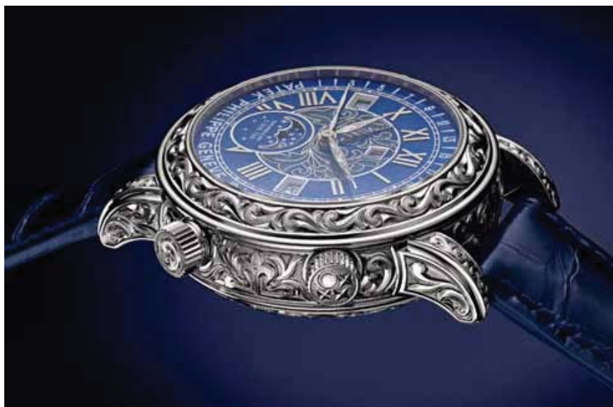
▼ Patek Philippe Sky Moon Ref 6002

Patek Philippe will only make a limited number of its Sky Moon Tourbillon (ref. 6002, 1.2 million Swiss francs), the most complicated watch it currently makes, combining a perpetual calendar with a retrograde date display, a minute repeater, a tourbillon, the display of sidereal time and a depiction of the night sky with the motion of the stars, the angular progression of the moon, and the moon phases with the métiers d'art of enamel and engraving. The awareness that the brand makes these watches certainly fuels the purchase of its regular collection watches (which are limited production anyway).