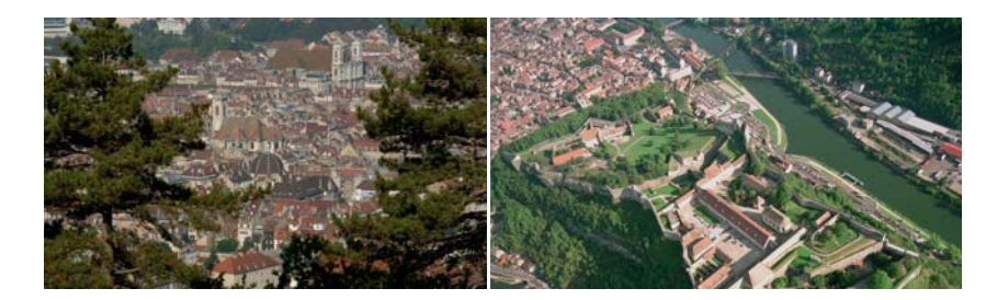
Museum of Time